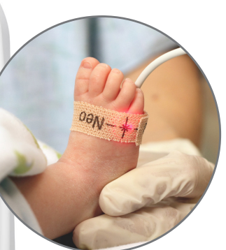
MASIMO Set SpO<sub>2</sub> module can be plugged into the back of the fabians.