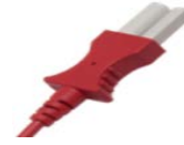
Shielded Lead Wire

TruLink ECG lead wires are designed and validated for use with Spacelabs monitoring systems. Ten foot reusable monitor cables are available in 3, 5, or 10 lead configurations. The reusable shielded TruLink lead wires feature individual color-coded leads with a 2-prong connection into the monitor cable. They are available in a variety of lengths with either a snap or pinch electrode interface. For use with Spacelabs command modules 90496/91496.